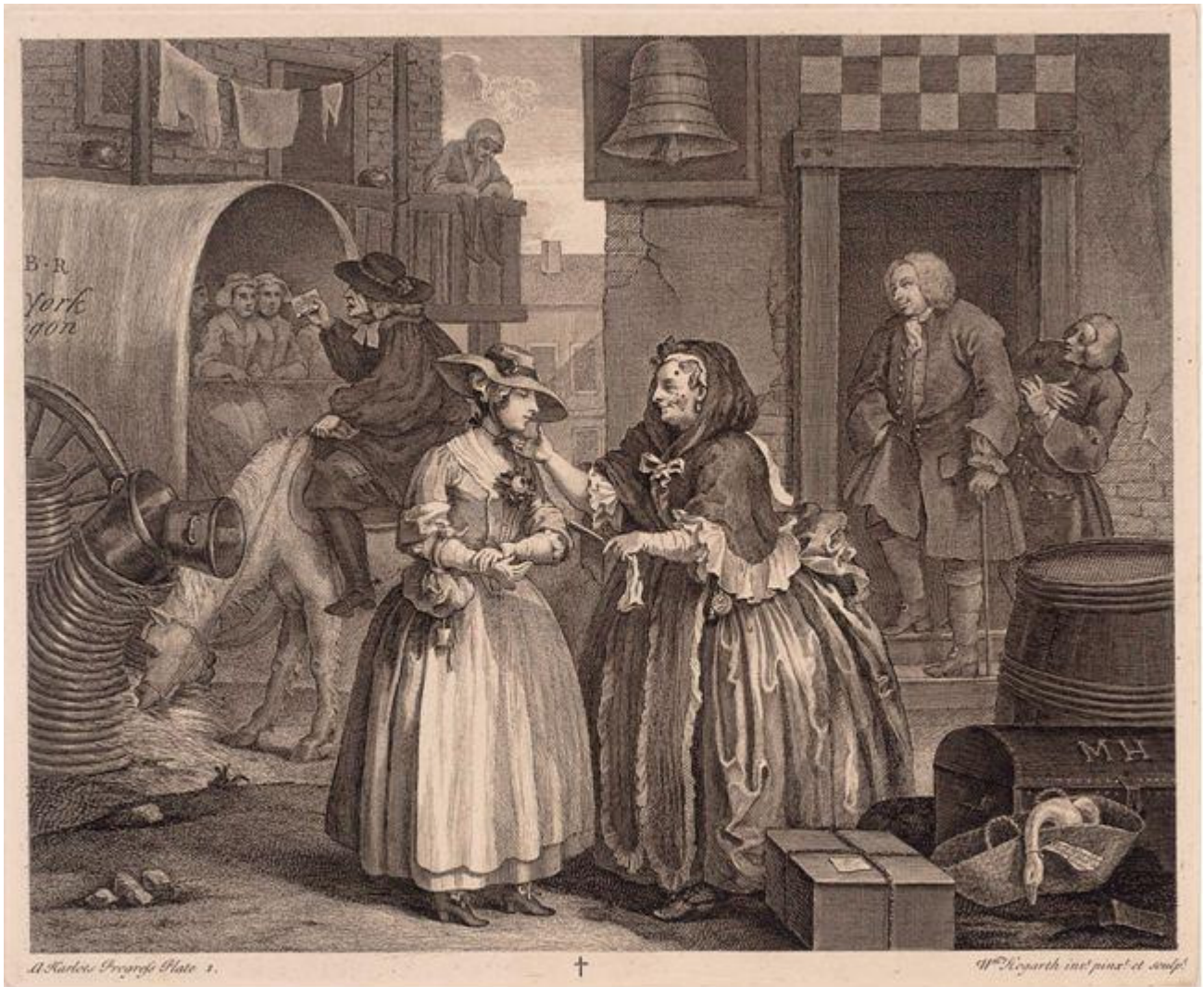
Hogarth, A Harlot's Progress 1732 Plate 1 'Moll's arrival in London' Engraving AGNSW Sydney