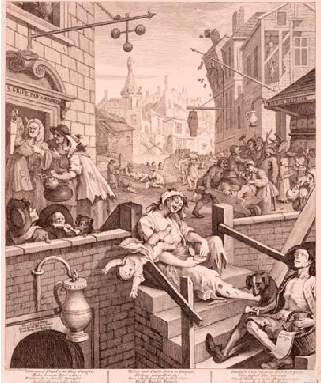
Hogarth Gin Lane 1751 Engraving AGNSW Sydney