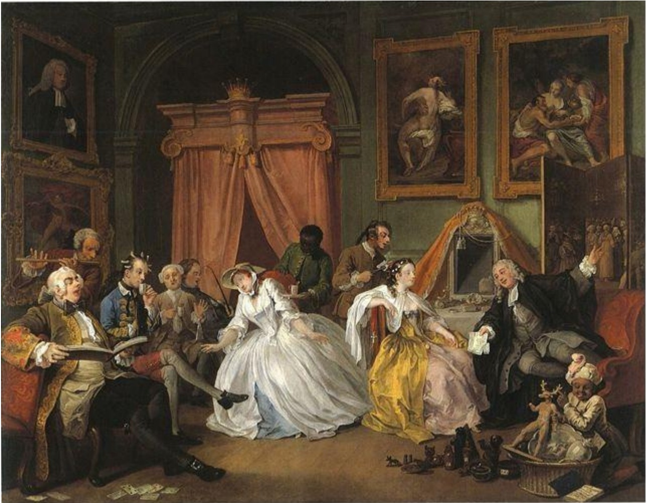
Hogarth Marriage à-la-mode: the toilette c.1743 oil on canvas National Gallery London