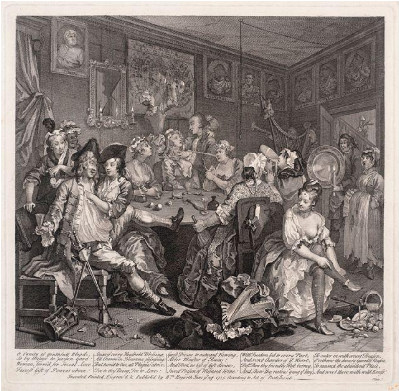
Hogarth A Rakes Progress 1735 Plate 3 The orgy Engraving AGNSW Sydney